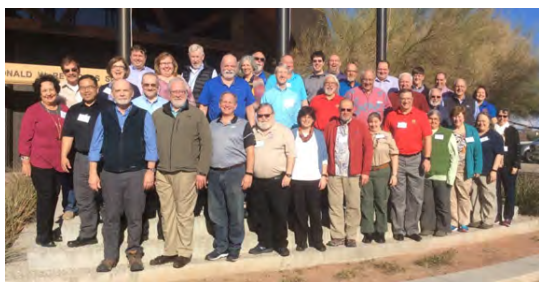
2019 National Volunteer Training Conference attendees in front of the Las Vegas Council Office.

During the last five years, the National Volunteer Training/Learning Delivery Sub-Committee gathered together at Scouting U Westlake Campus in Westlake, Texas, Bethesda, Maryland, and Las Vegas, NV. We enjoyed a weekend of fun, fellowship, learning, and idea-sharing. We looked back to where we had been and used feedback from the field in assessing where we need to go in the future.